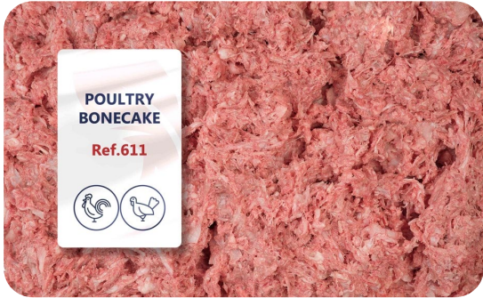
611 - Poultry Bonecake