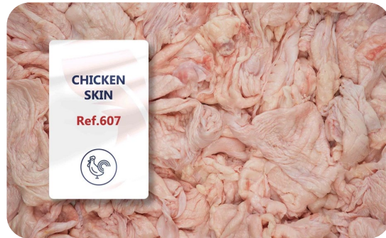
607 - Chicken Skin