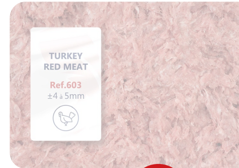
603 - Turkey Red Meat