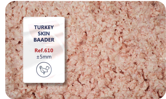
610 - Turkey Skin Baader