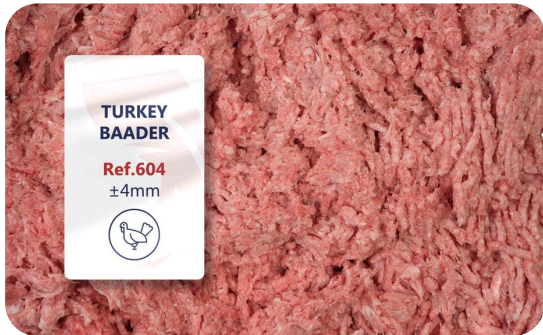
604 - Turkey Baader