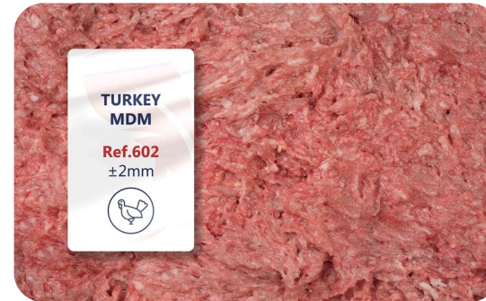
602 - Turkey MDM