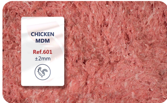
601 - Chicken MDM