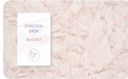
607 - Chicken Skin