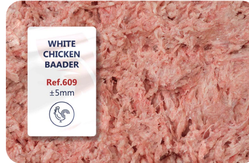
609 - White Chicken Baader