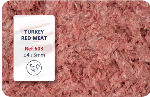
603 - Turkey Red Meat