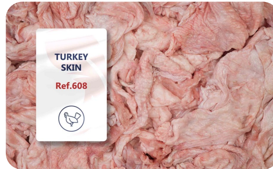
608 - Turkey Skin