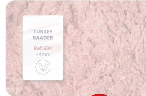
604 - Turkey Baader