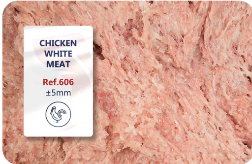
606 - Chicken White Meat