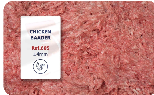
609 - Chicken Baader