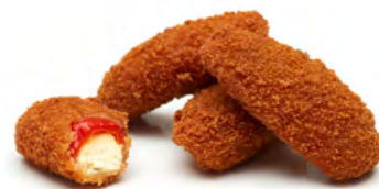
JALAPENO RED HOT