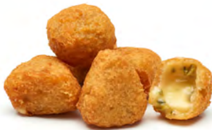
CHILLI CHEESE NUGGETS