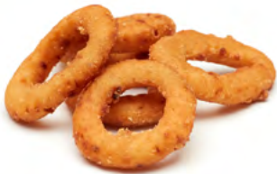
ONION RINGS PREFORMED