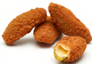
JALAPENO HOT CHEDDAR CHEESE