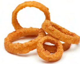
ONION RINGS HOT 'N SPICY