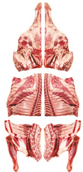
6 WAY CUT