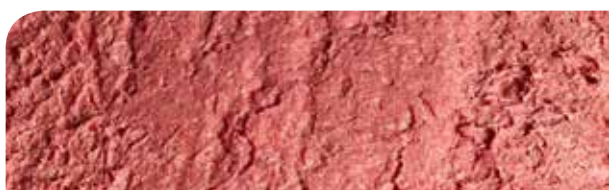
Turkey MDM // 602