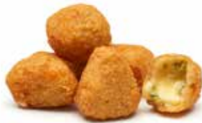
Chilli cheese nuggets

The way of having dinner has been changed fast the latest years; concepts as sharing food, finger food and small bites are trendy and they fulfill totally the younger generation in their culture of having dinner. Therefore, we as Damaco Group created a well select and high-quality range of appetizer products that can be launched in every market. Our packaging solutions are suitable to the food-service and retail requirements and have been created on request of customers worldwide.