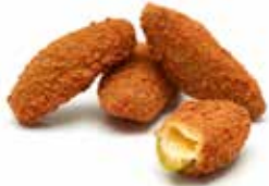
Jalapeno hot cheddar cheese