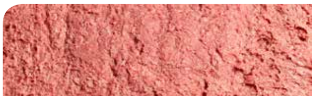
Chicken MDM // 601