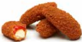
Jalapeno red hot