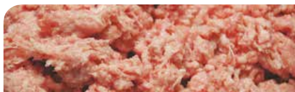
White chicken baader // 609 (3-5mm)