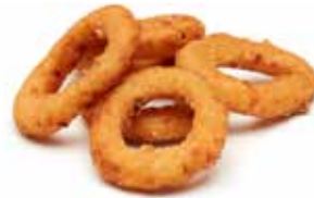
Onion rings preformed