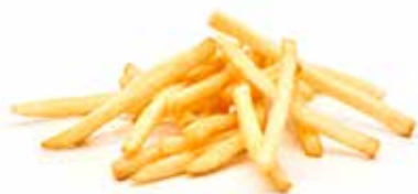
French fries (different types & cuts)