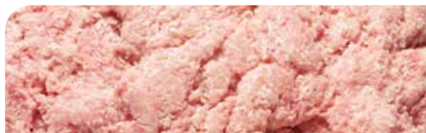
Chicken white meat // 606 (3-5mm)