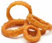
Onion rings Hot 'n Spicy