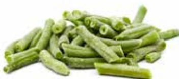
Cut green beans