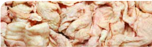
Chicken skin // 607

Looking for a solution to improve the binding of your product? Turkey- or chicken skin contains a high level of proteins and collagen that helps to upgrade the binding of your product. An additional advantage is the amazing taste that skin brings along in your recipe. On top of this, when working with high valued raw materials this 100% natural product will drive your cost down.