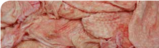
Turkey skin // 608