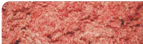
Turkey baader // 604 (3-4mm)