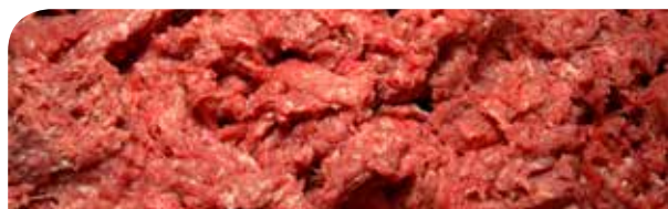
Turkey red meat // 603 (3-5mm)

What about Kipco-Damaco baader in your products? If you want to add more texture into your products then our baader types will fit your requirements. When talking about medium to big structure products types, a 4-5mm structure will allow you to produce the bite you need such as meatballs, hamburgers and medium fine sausages. Do not forget that you can combine Kipco-Damaco MDM, baader or other meat types with each other to improve the quality of your final product to the required level of your market. With over 50 year of experience in our industry, we are able to supply you with a variation of different baader types that fulfill the expected quality level of your final products.