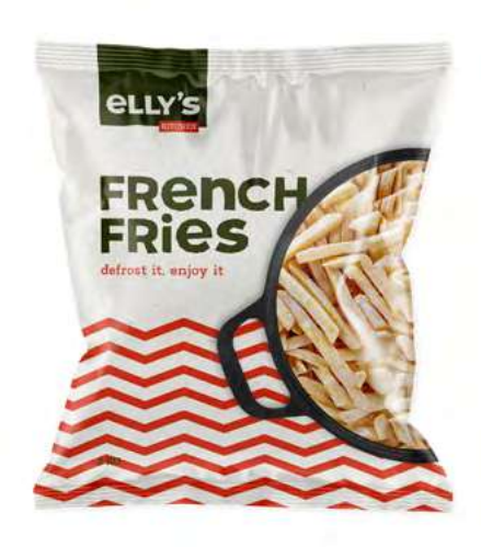
ELLY'S 2.5 KG & 1 KG