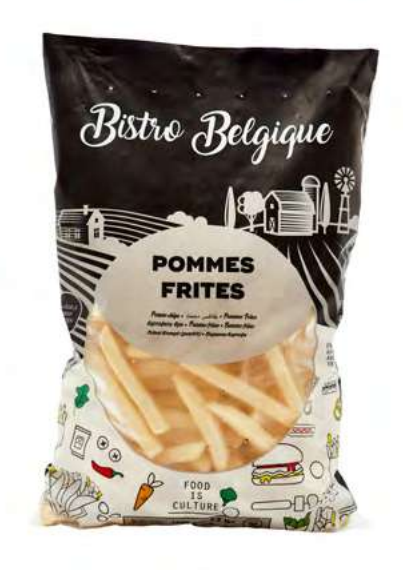
BISTRO BELGIQUE 2.5 KG & 1 KG