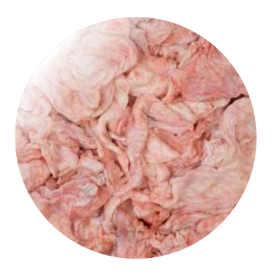
TURKEY SKIN 608