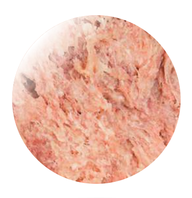
CHICKEN WHITE MEAT