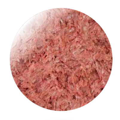
TURKEY RED MEAT