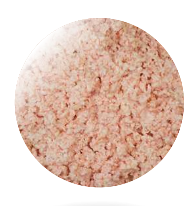
TURKEY SKIN BAADER 610 - +- 5mm