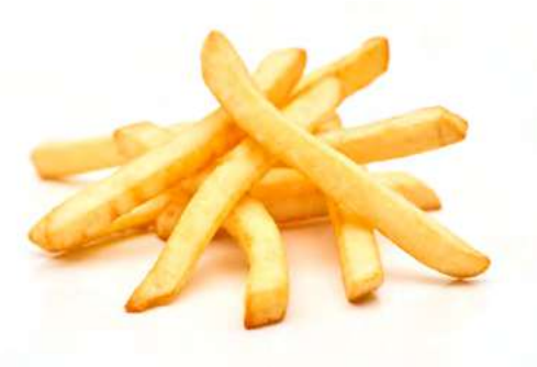
FRENCH FRIES 9x9mm