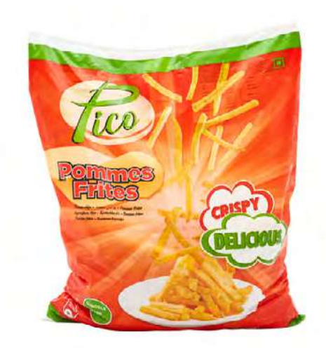
PICO 2.5 KG