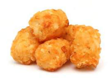
TOTTERS (MINI-HASH BROWNS)