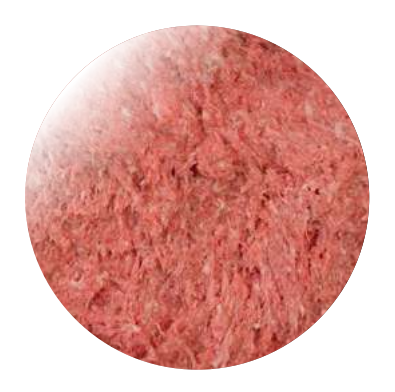
TURKEY MDM 602 - +- 2mm