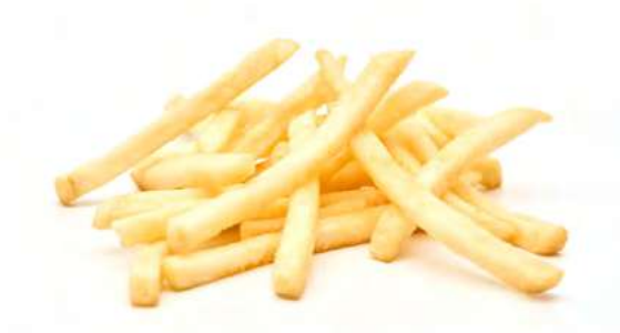
FRENCH FRIES 7x7mm