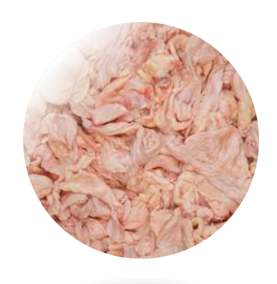
CHICKEN SKIN 607

Is the binding in your product as effective as it could be? The right turkey or chicken skin contains the high level of proteins and collagen needed to help binding. And it's full of flavour. Working with these raw, natural materials also drives costs down. The definition of a win-win situation!