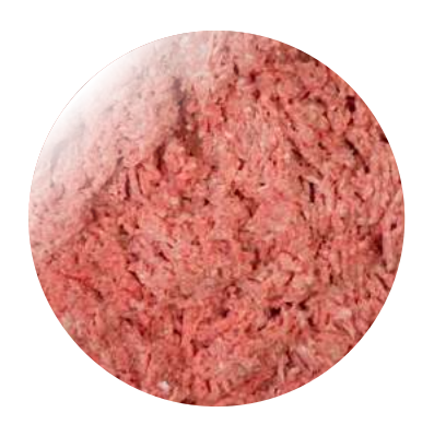
TURKEY BAADER 604 - +- 4mm