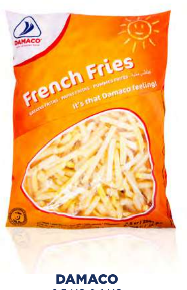
2.5 KG & 1 KG