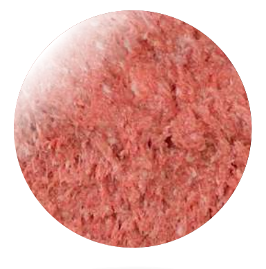
WHITE CHICKEN BAADER