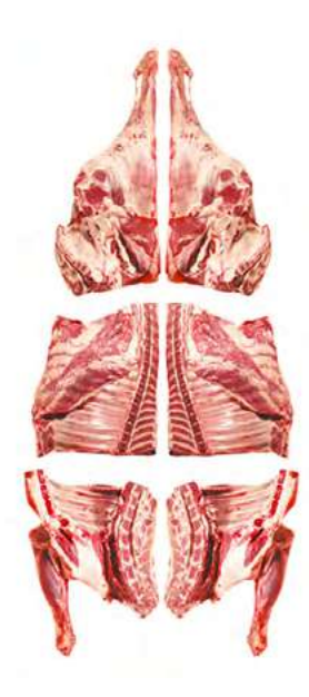
6 WAY CUT