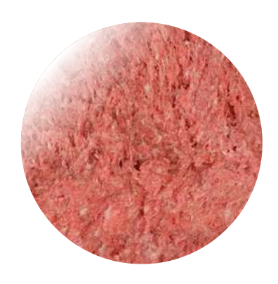
CHICKEN MDM 601 - +- 2mm

Kipco-Damaco uses a special soft production method to produce mechanically deboned meat (MDM) with a texture of +/-2 mm. This process guarantees the protein level of our MDM chicken and MDM turkey, making them suitable as stand-alone products, or for combining with other Kipco-Damaco products, such as Baader meat. As this production process also promotes binding and water absorption, our MDM meats are perfect for use in frankfurters, mortadella, nuggets, as well as canned and luncheon meat products.