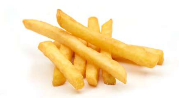
CRUNCHY COATED FRENCH FRIES 9x9mm (SALTED)